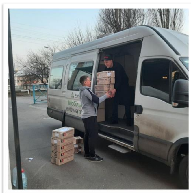
Provision of OAT medicines to the sites in Cherkasy oblast